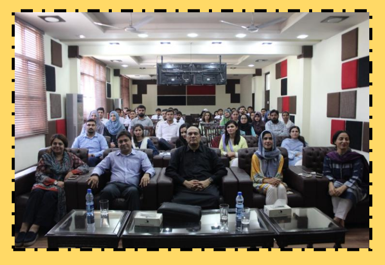
Prof.Dr.Pablo Goldschmidt delivered an interactive lecture to MSPH students on study designs protocols.